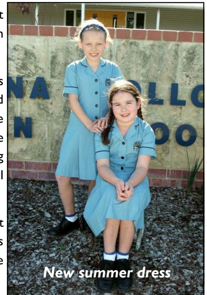
New summer dress

This week Year 5 and 6 students began their respective courses on sex education. It lead to reflect on an article titled SAFE SEXTING: No such thing written for the slightly older students and produced by the NSW Department of Education. In the article parents are urged to warn children about the dangers of 'sexting'— the growing trend for young people to send provocative images of themselves to their friends via mobile phones. Once photos